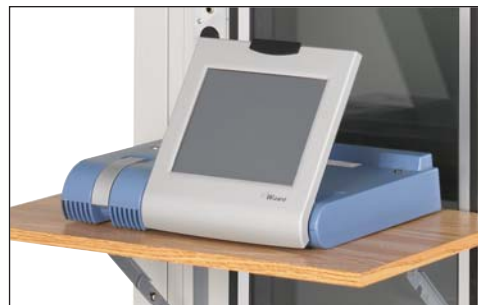
Folding audiometer/accessory shelf included.